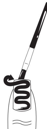
Illustration 1: Capping

CUTICLE OIL to back side of free edge and allow to flow into cuticles.